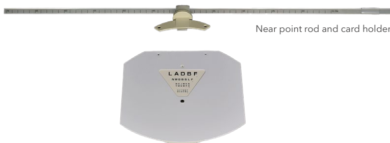
Near point rod and card holder