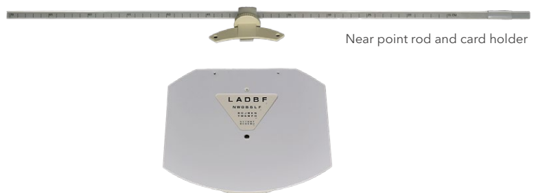
Near point rod and card holder