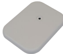
Table Base Stand

Design and specifications are subject to change without prior notice.