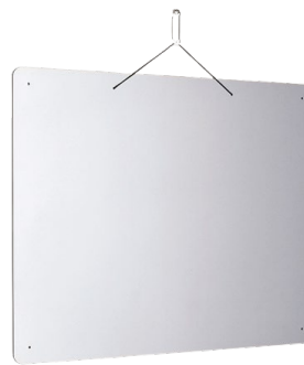
Projection Screen 530mm(W) × 340mm(D)